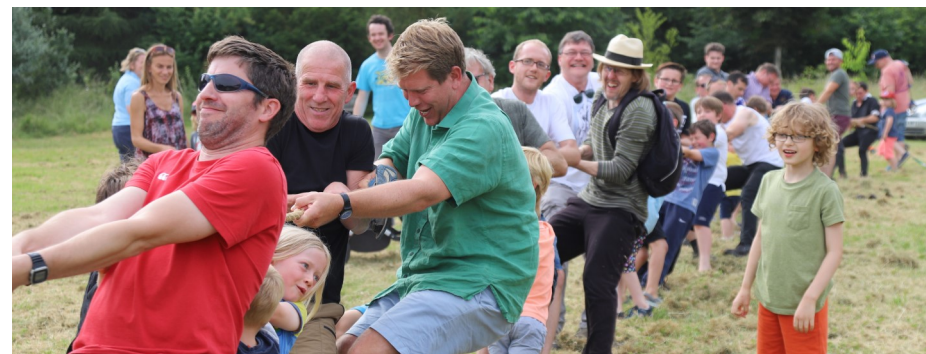
The boys finally win the 2018 Tug o' War after three years of girls' victories

See over the page for the full timetable.